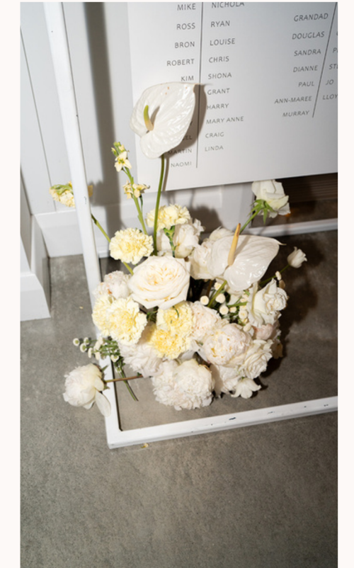
Table Stand Arrangement From $250

Bridal Table Install From $200 per metre with foliage